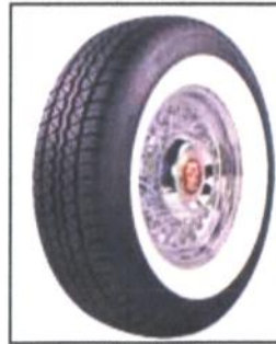
RADIAL WHITE WALL