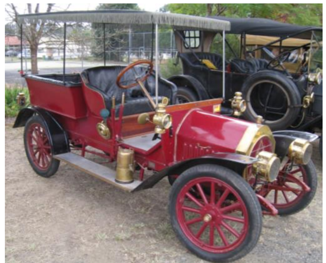
The NAG at Paxton Bowling Club 2012