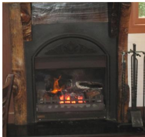
The log fire and wall heaters were very cosy