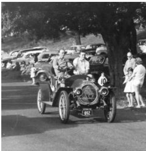
The NAG on the Blue Mtns Rally 1960