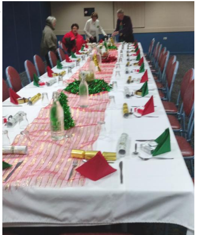
Ready for Christmas in July