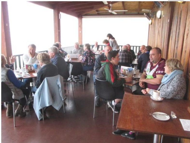
Some of the group enjoying a beautiful breakfast.