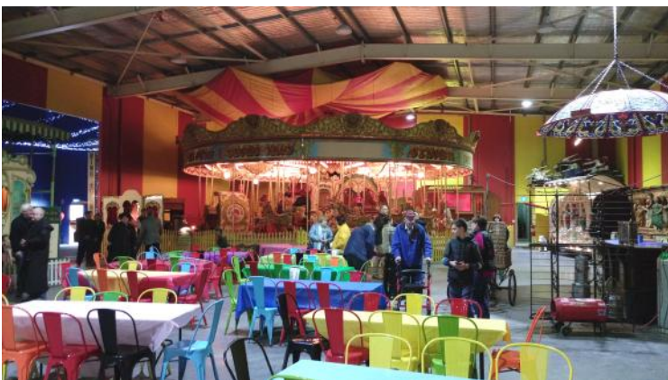
Morning tea at Fairground Follies

Now owned by the Sisters of the Good Samaritan, Wivenhoe is a Georgian villa built in 1837-38 for Charles Cowper, who later became Governor of NSW on several occasions. It's a well-proportioned two storey house with well-designed details. The stables were designed by John Verge and the house is also likely to be his design. The shutters on the downstairs windows allowed the windows to be barred at night for protection against the bushrangers and other hostile people while during the day they were recessed into the window frame.