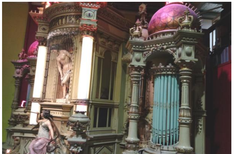
Fairground Follies- The Taj Mahal the largest musical machine in the world. Note Aphrodite behind the waterfall!