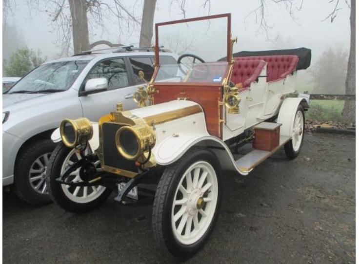
A rare sight 'Tilly' with uncleaned brass! But at least she was there.

After breakfast we visited the nursery with many varieties of geraniums and pelargoniums. Some were flowering and there were many with unusual scents and flavours. A shed housed old farm and gardening tools, garden decorations and pots.