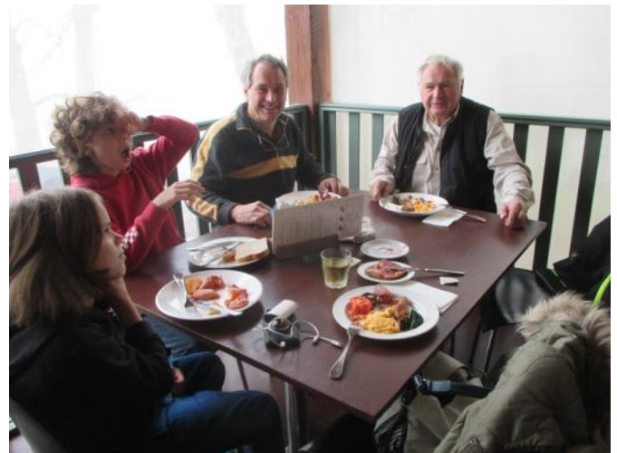
The Shinfield Clan.