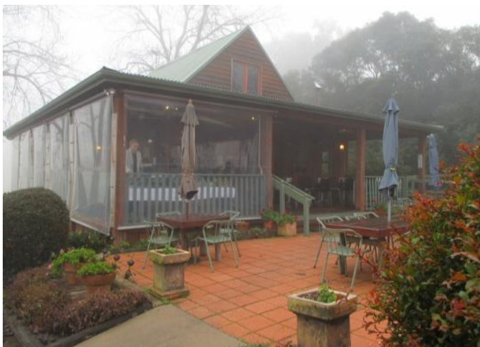
A fogbound Geranium Cottage Cafe

The breakfast run to Geranium Cottage started fine with a pea soup fog about 100 mtr sight in front of you and this made the entrance rather hard to see. There was a good roll up with only 2 veterans - both from Galston. The venue was very good with heating, very pleasant hosts. When we decided to depart one of the veterans decided it would consume as much water out of the radiator into number 1 cylinder as was put in, any way it started an raced off home. The other local who had a total trip for the day (about 8 ks) ran out of petrol about 2 ks from home and needed road side assist from another local to get some fuel. We had a good day with good friends.