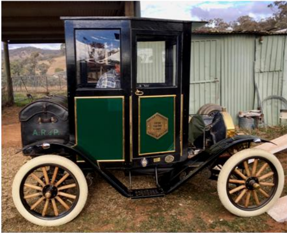
1910 “Top Hat” Brush Model E Coupe