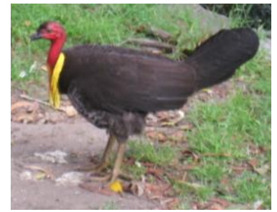
One of the locals