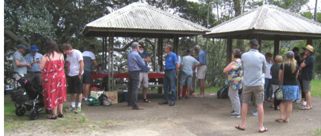
Some of the group.

For the return trip we took the old Pacific Highway watching