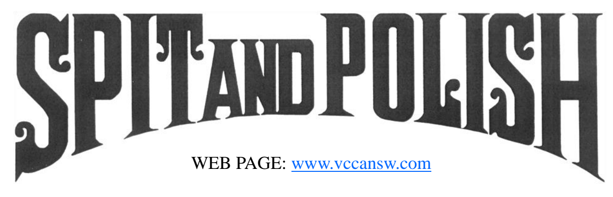
TABLE OF CONTENTS – November 2018