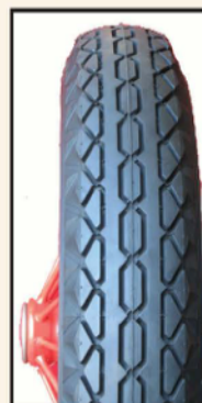
600 X 20"