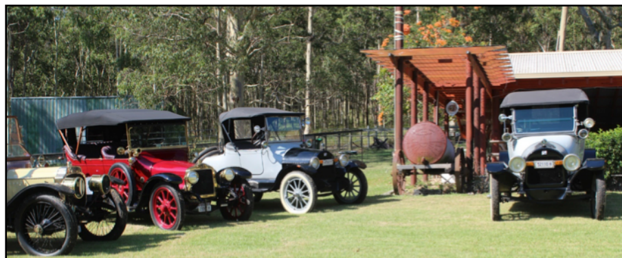
Some of the cars flanking the 'Furphy's Farm Water Cart'