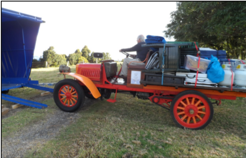
Loading up on the way to Yamba 1&2 Cylinder Rally 2018