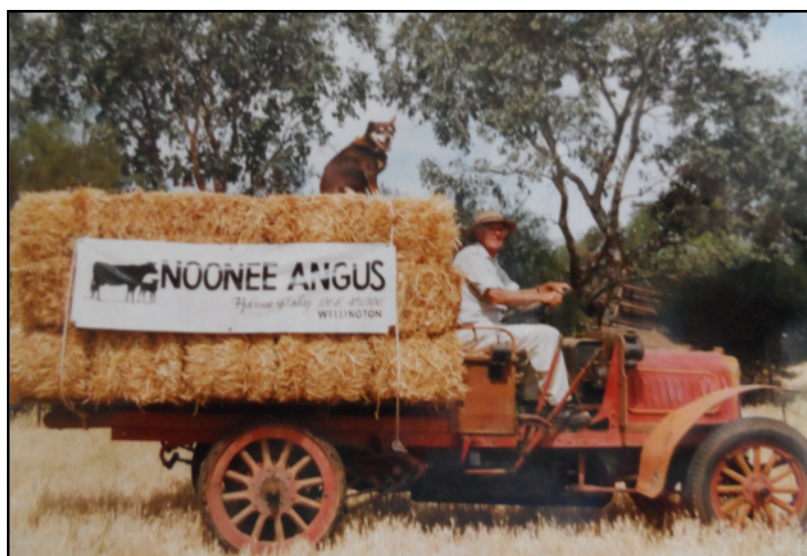
Left: Working duties at Wellington