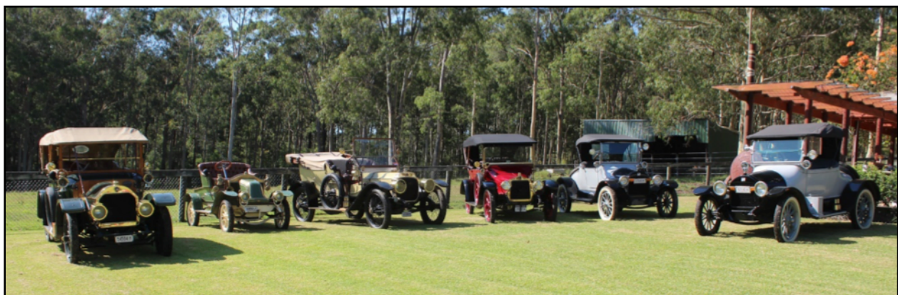
FN, Renault, Vauxhall, Talbot, Buick 1, Buick 2