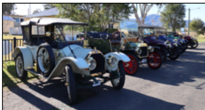
Chalmers, Ford, Talbot, Talbot, Chevrolet, SCAT