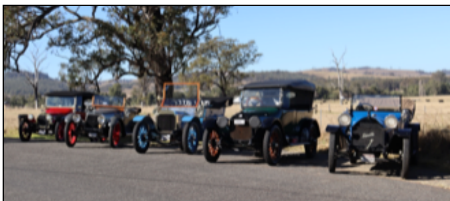
Talbot, Talbot, Vauxhall, Buick, Hupmobile