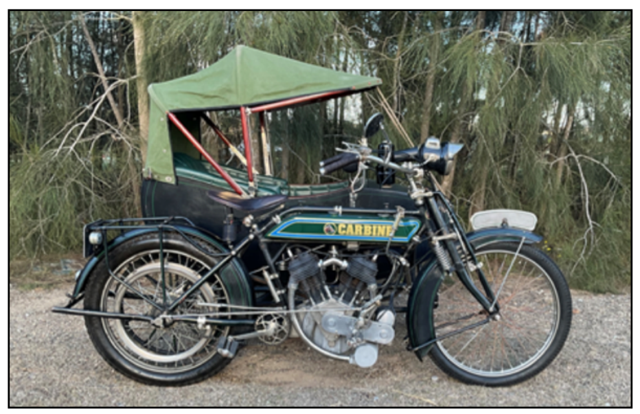
998cc Side Valve 50 degree V Twin (8HP JAP) Splitdorf water proof magneto A.M.A.C Carburettor Hand operated oil pump with drip feed. 3 Speed Sturmey Archer model J hub in rear wheel Belt Drive