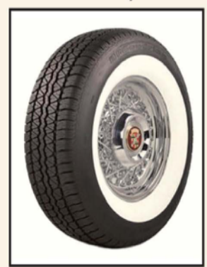
RADIAL WHITE WALLS