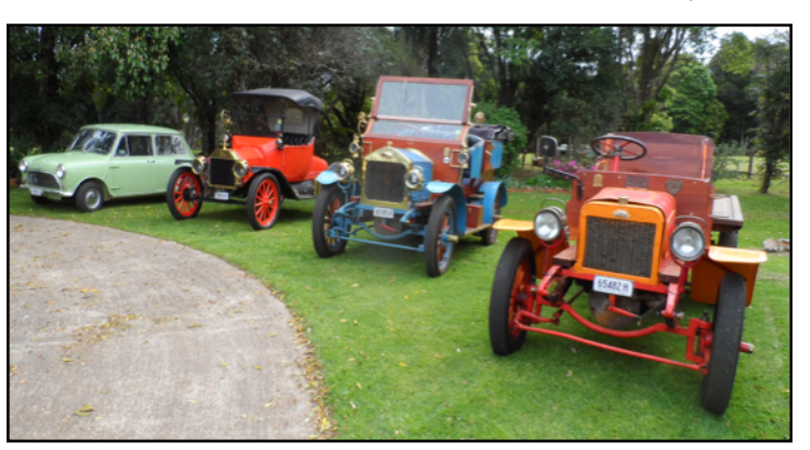
The cars: 1908 Albion, 1911 Albion, 1915 T Ford, 1970 Mini K 1100