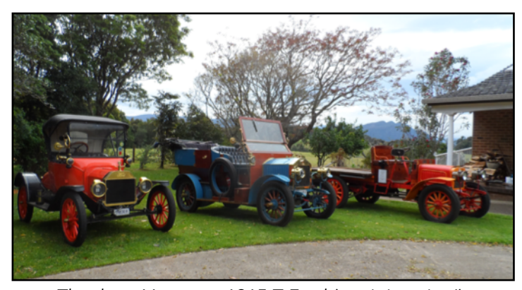
The three Veterans: 1915 T Ford (yes it is going!), 1911 Albion "Bluebell" and 1908 Albion Lorry

"Got the cars out of the shed on Father's Day for a solo COVID parade at our house"