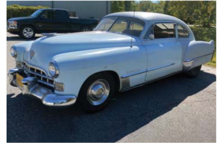
1948 CADILLAC FASTBACK COUPE. Running driving car that was road registered in the USA, rare manual transmission, LHD, needs paint. #7339 $49,000