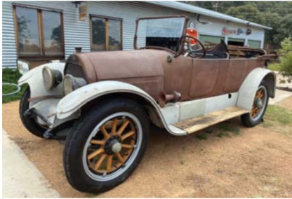
1918 CADILLAC. Large 314 cubic inch V8, seven passenger touring car, great body, in need of restoration. #7431 $23,000