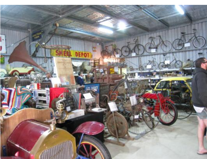
Inside the Denman & District Heritage Village building.