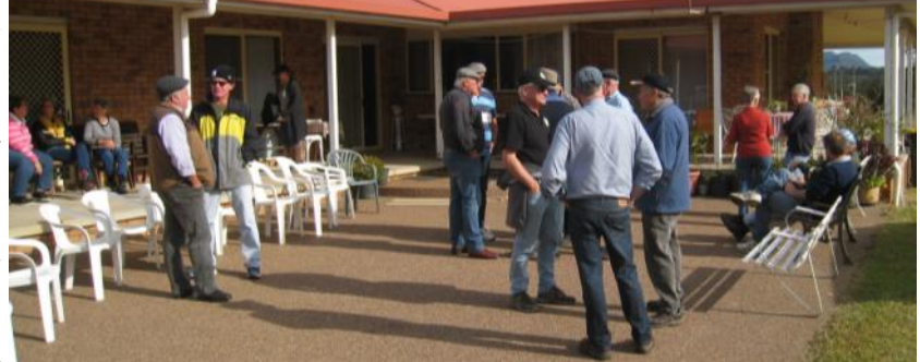
Morning tea at the Burke's

We headed south down the highway to Whittingham then along Range Road past the Army Museum to the Golden Highway, then followed the highway to Mt Thorley, on through Walkworth to Jerrys Plains for our morning tea stop in the Recreation Reserve,