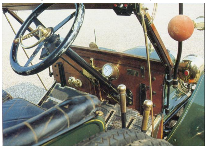
The high-mounted steering wheel gives the driver a clear view of the road ahead.

By 1907, Adler had gained an enviable reputation for solid engineering and produced a wide range of cars, which was, possibly, too comprehensive, ranging from a 9-litre down to a 1.3-litre. Business was booming and Imperial approval was received in that year when two cars were supplied to the Hohenzollern family. Adler employed a labour force of 3,000 and claimed to manufacture everything itself, including carburettors. 1909 saw the opening of an aero engine department, but Adler was not to be as successful in this field as B.M.W., Argus, Daimler and Benz. Motorcycles had been also produced since 1902 and remained in production until 1912, when they were discontinued, owing to lack of space in the factory. They were reintroduced many years later and in fact outlasted car production, manufacture finally ceasing in 1957. Cars were discontinued in 1939.