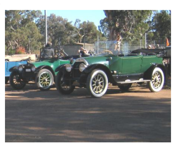
Buick & Cadillac at Denman