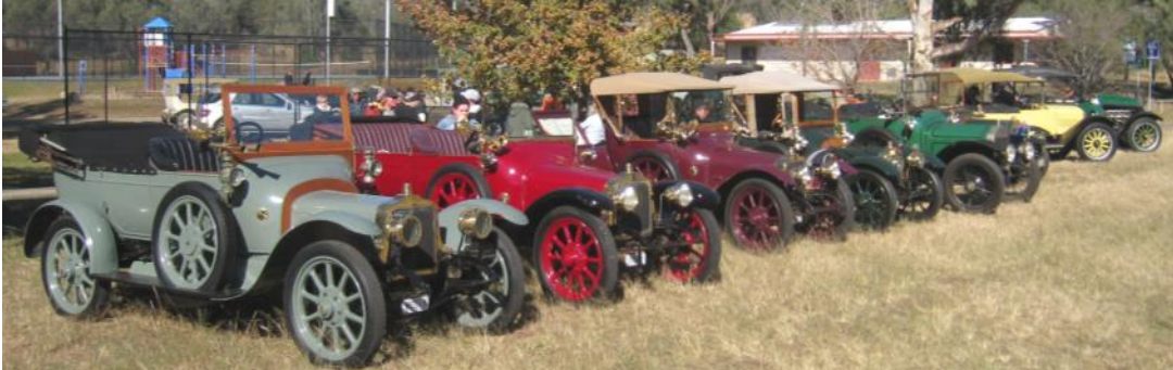
Morning tea stop at Jerrys Plains

From morning tea we took the back road to Denman which took us through the dairy and farming country and kept us of the busy Golden Highway. There used to be a number of dairies, but now there appears to only be one still operating.