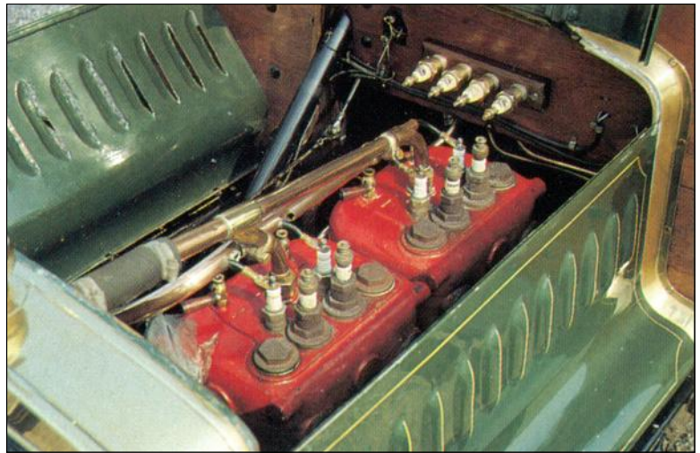
Near-side of the 1,821cc side-valve four-cylinder engine

The 12hp Adler, as sold by Morgan and Company in Great Britain, was available to three specifications in 1909. The short chassis was fitted with an extremely smart fast runabout lightweight two-seater body. This cost £280 and was a nippy little car in its day, noted as a good hill-climber with a fair turn of speed on the level. It had a higher back axle ratio than the touring cars. The long chassis was available with a four-seater