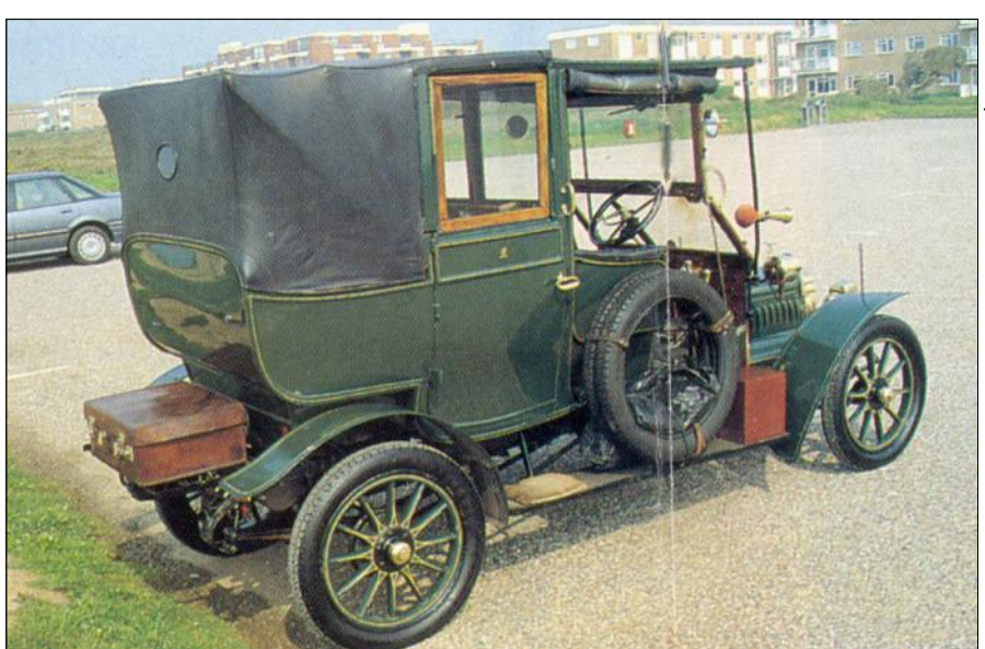
Brian Firth's 12hp Adler is a delightful car form any angle

The specification of the 12hp Adler was quite simple - an important consideration, as many purchasers in 1909 had not previously owned a motor-car. Ease of maintenance was a major attraction. Success in the 1908 R.A.C. Reliability Trial had drawn much interest and ensured that potential purchasers were aware of Adler cars. It is impossible to examine the mechanical details of the massive chassis frame without realising the care that had been taken in combining robust construction with extreme neatness and accessibility. For example, every nut and bolt has been split pinned. It is built of pressed channel-section steel with the side members turned downwards at both extremities. The four cross-members are of similar section, splayed and gusseted where they are attached to the longitudinal and the forward pair are swept downwards to carry the combined engine and gearbox unit, which incorporates the clutch and a transmission brake. The engine is a typical small capacity design of the period. The cylinders are cast in pairs which are mated to an aluminium crankcase.