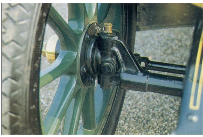
No front-wheel brakes. The front axle design is simple but sffective

and two trips to Denmark. Two expeditions have been made to Southern Germany, during one of which it covered 1,200 miles in a single week. Single trips have been made to France, Belgium and Luxembourg. On each of these journeys it has proved extremely reliable. Old car regulations being what they are in Europe, certain modifications have had to be made in order for it to conform with road traffic regulations. For example, a modern alternator is fitted together with modern electric lighting, which has been well disguised in the period gas lamp surrounds. In addition, a windscreen wiper system has been installed together with trafficators, which are essential when the car is used in some European countries. All these are acceptable modifications if it means that the car