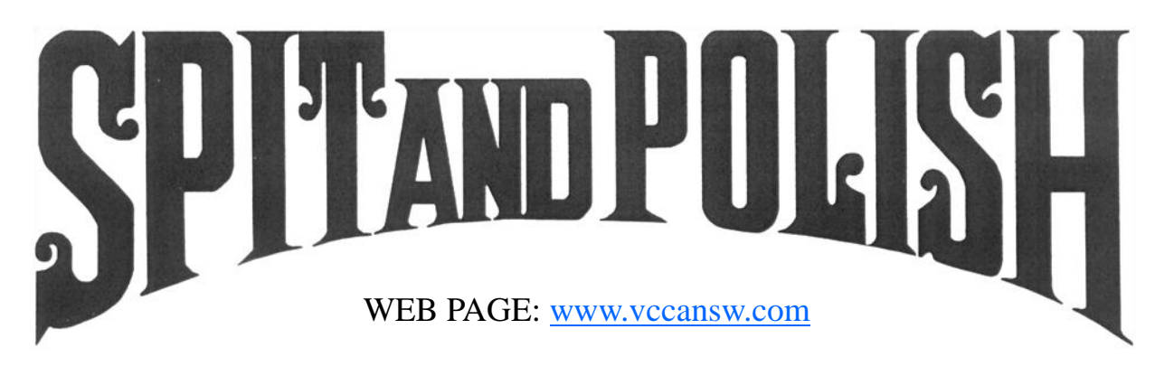
TABLE OF CONTENTS – July 2019