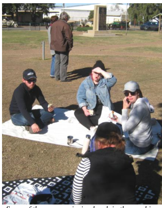
Some of the group enjoying lunch in the sunshine at Denman