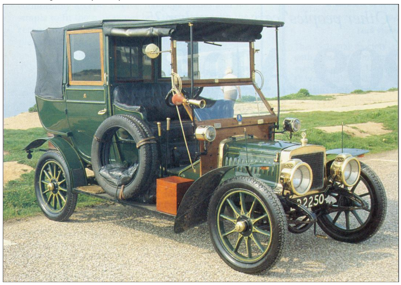
There is little indication that electrical system of the car has been up-dated to conform with current European road traffic regulations,

Good heavens! Now here is a surprise, a four-wheeled typewriter! Nowadays best known for its office equipment, most people have forgotten that Adler made cars and, indeed, were highly respected for so doing. Founded in Frankfurt, Germany, by Heinrich Kleyer in 1880, the company were extremely well known by 1899 for manufacturing Herold bicycles. By that time 100,000 machines had been delivered.