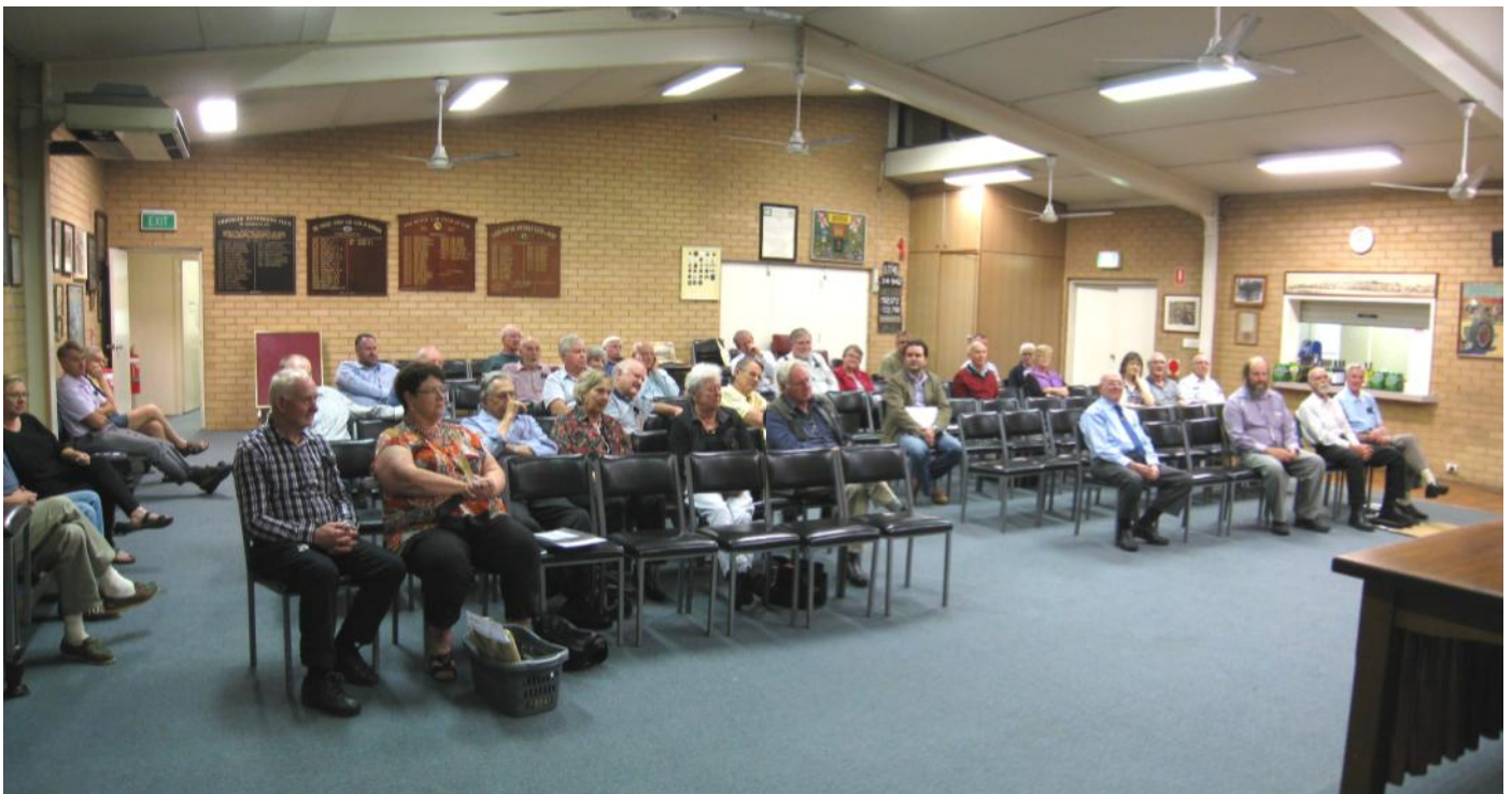
Club meeting night 28th April 2016