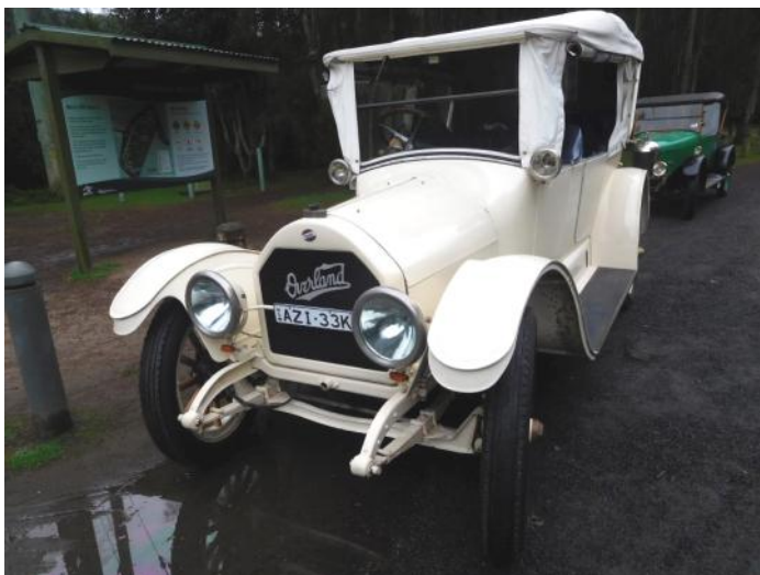
The Streatfeilds' 1915 Overland

Despite the heavy showers overnight, the 21 participants of the Sydney North Breakfast Run were not deterred. After a flurry of phone calls to discuss the weather, the decision was made to continue with the event at Crosslands Reserve.