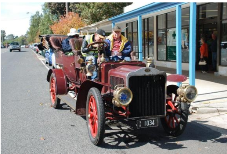
White Model OO