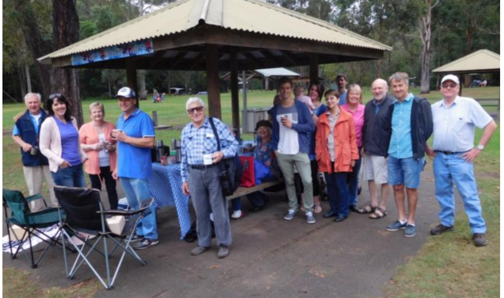
Most of the group