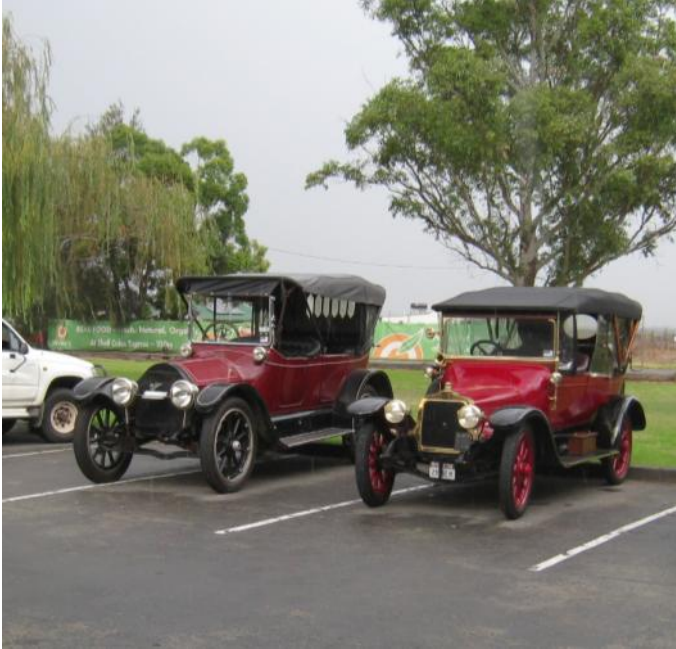
Allen Dunlop's '14 Cadillac & Graeme Newman's '14 Talbot

Our Branch outing for April was to be a visit to the Newcastle Museum in Workshop Way, Newcastle. The current Museum which opened in 2011 is housed in what were once Railway Workshops when the foreshore area of Newcastle was dominated by heavy industry, with much of the southern (Newcastle) side of the river being dedicated to the railway.