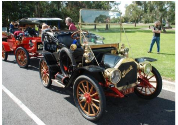
1910 Model 14 Buick