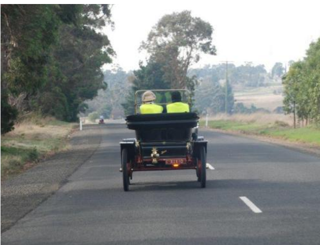
1910 Model 14 Buick