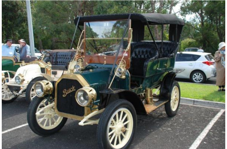
1909 Model F Buick

Sunday was registration and welcome evening, a great way to catch up with other entrants some of whom we hadn't seen for two years or so.