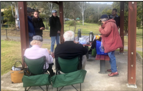
Lunch at Wollombi