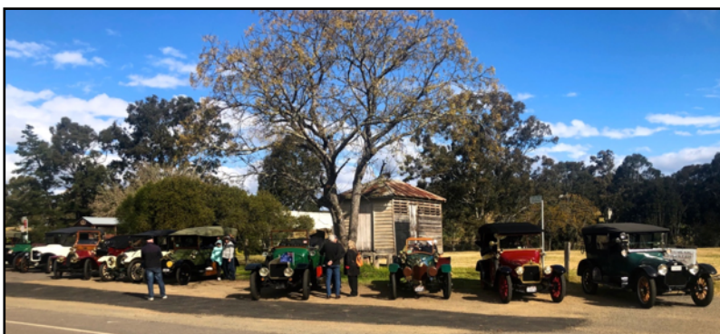
Some of the cars parked at the Wollombi lunch stop

Our weekend started a bit differently to most as there were just the three of us in one car heading off to the start at Nulkaba on the Friday morning. With Neville Preston off the road due to health issues, the Gotley's and Roses having working commitments and me still having one car without a hood, we decided we would all travel in the one car. To top it off, Karyn wasn't able to join