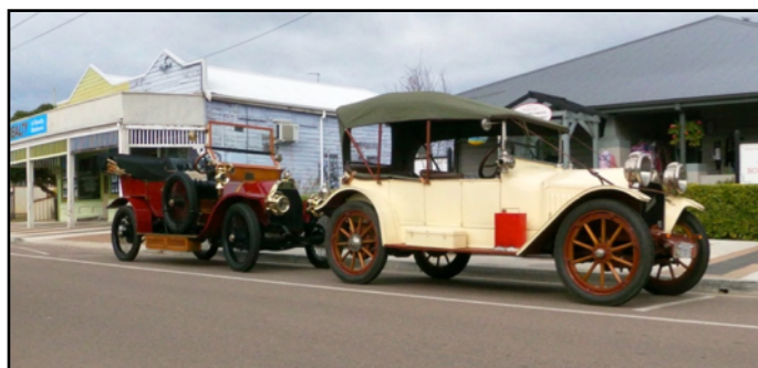
The Scat and Hupmobile - Denman lunch stop