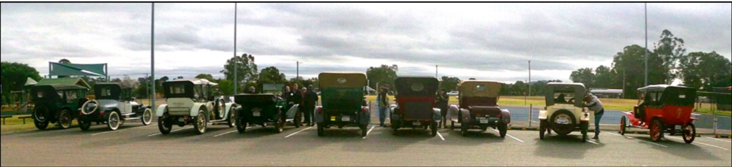
Most of the cars at the morning tea stop/end of tour at Branxton