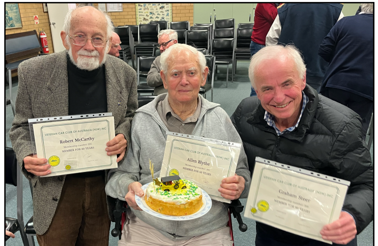
60-year badge recipients