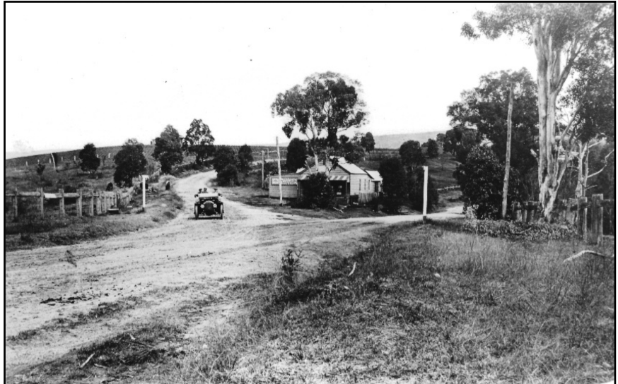
The Main Road. Kurragong.