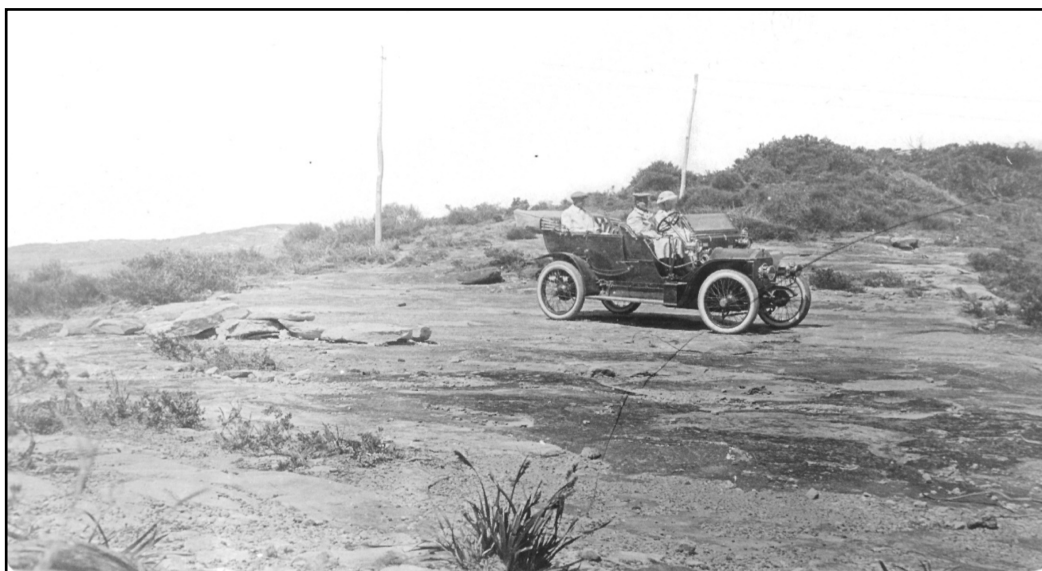
On the road to Barranjoey. North of Newport.

Whilst it is rather difficult to make out in this photo. The advertisement on the building is for Inglis Goldenia Tea.